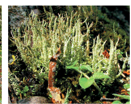
Fascinating Forest Facts

Some lichens have more than one algal partner.