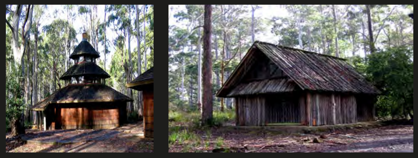
The chalet and education centre and the store shed constructed in the 1980s

In 1987 the University of Tasmania designed and constructed an education centre to present an image of a tranquil place of learning and observation as well aas providing some forest interpretation to visitors.